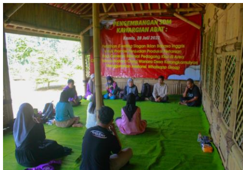
Gambar 5 Extention, FGD and offline training in Sipatahunan Gazebo

Kvale (1996), FGD is beneficial to ignite participants motivation and dig out the information and knowledge of phenomenon in the real world.