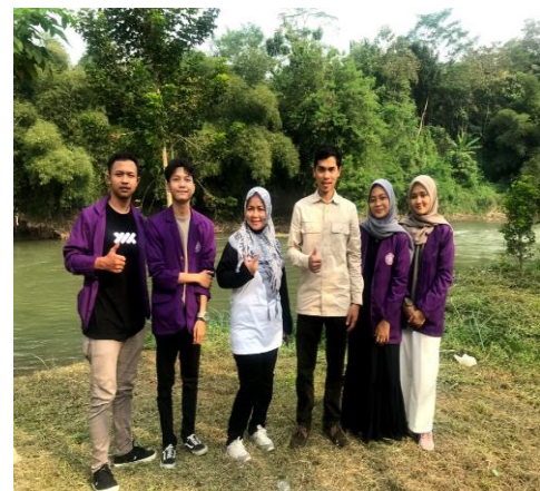
Picture 4. The Team with Sipatahunan River background

The second step is conducting Focus Group Discussion (FGD). All participants got together with the team of Community engagement in on roof. The traditional site or Gazebo where the training of E2AS took place is named Sipatahunan. It is established in 2019 as the new site in for having a family gathering, outdoor meeting, etc. Sipatahunan is labelled to this site because the locus is right front of the Sipatahunan river (See Picture 4). Sipatahunan is very popular since it has been the river where the baby of Ciung Wanara was floated off until He was found by Eyang Balangantrang. Later on, Ciung Wanara keep the throne of Galuh Kingdom.