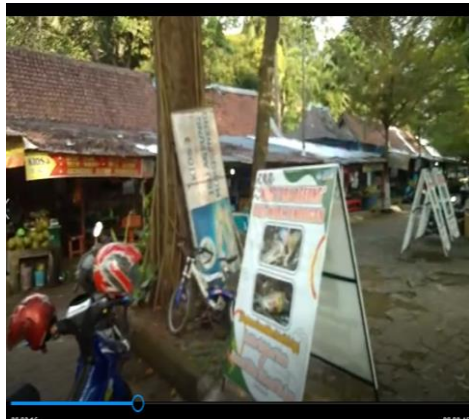
Picture 2. EAS displayed in front of kiosks

The result of interview is transcribed, coded, categorized, and interpreted; meanwhile, the documentations of English advertising slogan advertising are analyzed utilizing a rubric of slogan. After one collaborative slogan was created and printed (See Picture 1), it was made into 14 banners of EAS that were displayed in front of their kiosks (See Picture 2).