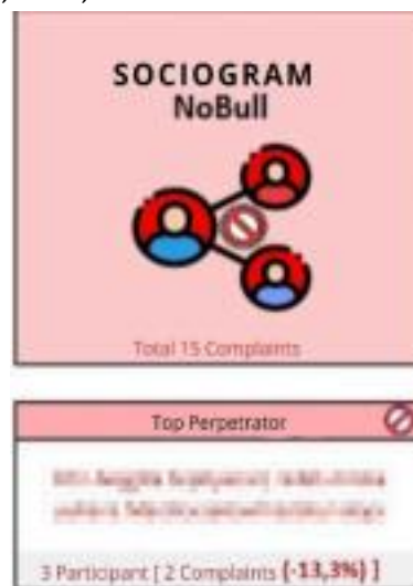
Figure 4. Sociogram Results of the Highest Bullying Perpetrators Class X MP 2

Meanwhile, Class X MP 2 consists of 26 female students. The Top RS sociometry results show that eleven students have been identified as bullies based on their classmates' reports through the NoBull application. Among them, FAS, LRY, and MZRA each received 2 reports, while AMS, FF, ISS, MSS, NYA, PDE, RWR, and RIF each received 1 report.