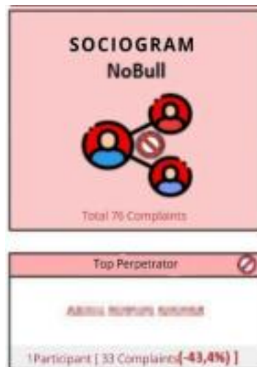
Figure 8. Sociogram Results of the Highest Bullying Perpetrator in Class X TKJ

Class X TKJ consists primarily of male students, totaling 21, with the remaining 5 students being female, making a total of 26 students. Based on the Top RS results above, five students have been identified as bullies: four male students and one female student. The details are as follows: ARA received 33 reports, AR, AG, and FA each received 6 reports, and RANC received 4 reports.