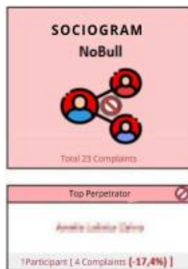
Figure 6. Sociogram Results of the Highest Bullying Perpetrator in Class X PF

Class X PF consists of 26 students, with a composition of 16 female students and 10 male students. Based on the reports received from classmates through the NoBull application, five students in Class X PF have been identified as bullies. The bullies in this class include both male and female students. Among them, a student with the initials ALZ received 4 reports. IFZ, NMAA, and ZDM each received 3 reports, and INA received 2 reports from their classmates.