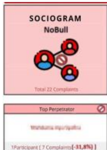
Figure 2. Sociogram Results of the Highest Bullying Perpetrators Class X MP 1

Class X MP 1 consists of 23 students, with the majority being 21 male students and the remaining 3 female students. The results from the Top RS sociometry above indicate that several students have been identified as bullies based on their classmates' reports through the NoBull application. The details are as follows: WAS received 7 reports, AW and PNZ each received 3 reports, FFA and FAJ each received 2 reports, and ANSA, ID, JAP, NA, and AHD each received 1 report. All 10 of these names are female students.