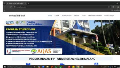
Figure 1. Front Page Display

-Main Page titled Faculty of Education Innovation Works, which displays a list of innovation products.