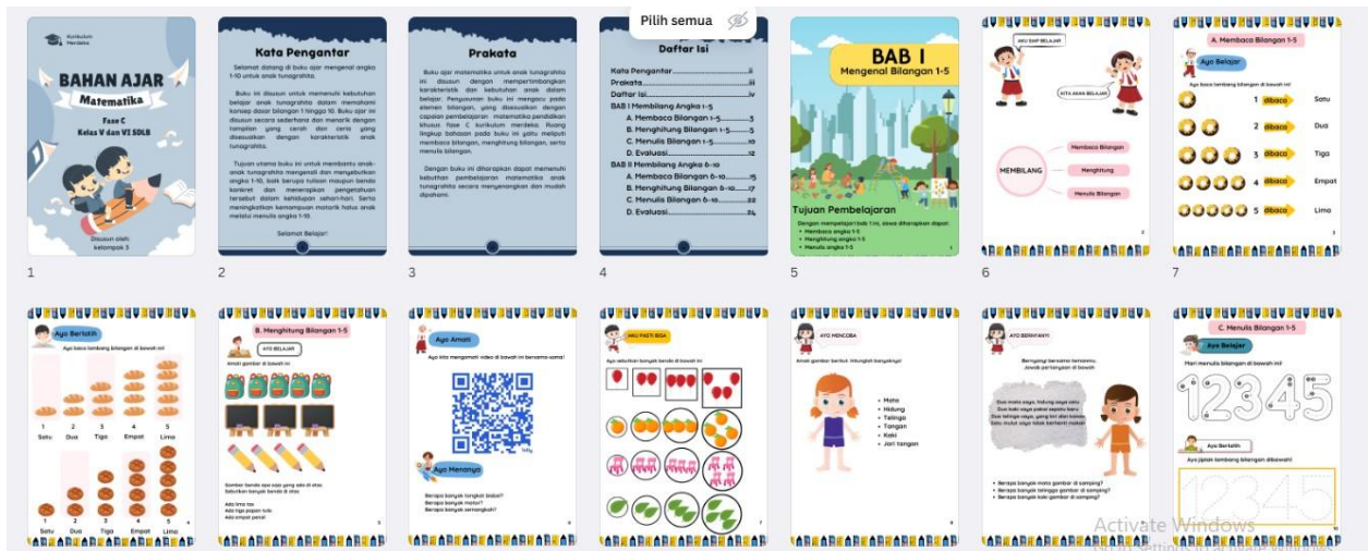
Figure 2. Display of Teaching Materials

The use of teaching materials to introduce numbers 1-10 that were developed was by (1) the initial step of inviting students to find out what will be learned, (2) after that inviting students to look at pictures and read the numbers 1-5 that are in the teaching materials, (3) then inviting students to practice reading numbers 1-5, (4) inviting students to count the pictures in the teaching materials, (5) scanning the barcode in the teaching materials to watch the video, (6) asking students to practice counting and singing, (7) inviting students to write numbers 1-5 starting from tracing, coloring and writing independently, (8) doing the evaluation that has been provided in the teaching materials.