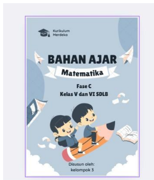
Figure 1. Initial View of Teaching Materials

This teaching material is to introduce numbers 1-10 which has been developed over a period of 1 month. The development of teaching materials requires a smartphone or laptop and an internet network in its creation. The stages of developing teaching materials are (1) analyzing children's needs and determining the material to be presented, (2) making a design of teaching materials to be presented, (3) collecting materials and evaluations needed in teaching materials, (4) making a project for compiling teaching materials, (5) adding a barcode used to scan videos directly connected to YouTube, (6) testing teaching materials, (7) finishing by downloading teaching materials.