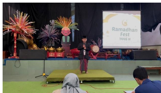
Figure 2. Religious Speech Contest

Next, there was a kulum competition, aimed at upper grade students (grades 4-6) to practice public speaking skills, convey moral messages, and demonstrate religious understanding. The students showed courage and good preparation in delivering their messages. The kulum competition significantly encourages students to reflect on religious and moral values and to express their own understanding. This activity is also expected to build children's self-confidence and mental strength.