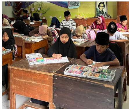
Figure 1. Calligraphy Coloring Contest

The calligraphy coloring competition is participated in by students from grades 1 to 3. Students were seen to be active and fully concentrated during the competition. The activity proceeded smoothly according to the initial plan. Students also appeared enthusiastic throughout the activity. This activity is also expected to enhance students' creativity.