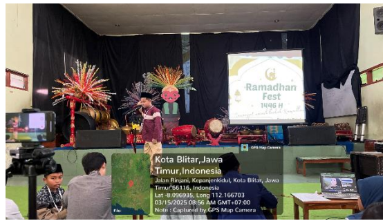
Figure 3. Adhan Competition

fosters a love for Islamic preaching. The demands of focus and calmness in the adhan and kultum competitions directly train emotional regulation.