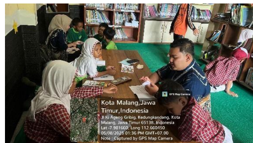
Figure 3.4 Providing solutions to students

To address students' difficulties in reading and writing, various integrated efforts are needed, such