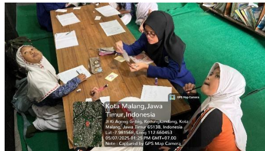
Figure 3.3 Students practice reading and writing

Based on the results of interviews conducted alternately with several students, the researcher asked a similar question, namely, “Do you enjoy reading?” All three students gave answers that indicated a low interest in reading. The first student stated, “I am reluctant to read; I prefer playing with friends.” The second student added, “I cannot read fluently, so I feel embarrassed when asked to read in front of others.” Meanwhile, the third student said, “When asked to read, I get confused by the letters, so I prefer pictures or playing.” In addition to questions about reading, the researcher also asked follow-up questions, such as “Do you enjoy writing?” The answers given also showed similar challenges. The first student answered, “Writing is tiring; my hand gets sore, and my writing is bad.” The second student said, “I get confused about what to write because I haven’t memorized the letters yet, so sometimes I just copy my friends’ writing.” The third student revealed, “I often forget the letters, so my writing is often wrong.”