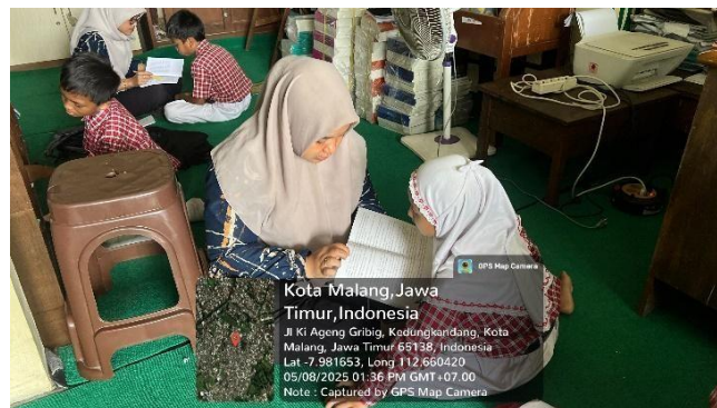
Figure 3.1 Students practice reading

The beginning of reading is the initial stage of reading learning that forms the basis for reading learning in subsequent grades. At this stage, students learn to recognize letters, syllables, words, sentences, and begin to be able to read in various contexts (Ramadhani & Wulandari, 2022). The difficulties in reading and writing experienced by students in grades 1-2 are caused by their developmental stage, which is still in transition from the world of play to formal learning. At this stage, students are generally not yet fully prepared cognitively and emotionally to receive intensive reading instruction. The observation results show that first and second graders still read by spelling out each letter and often make mistakes in pronouncing certain letters. The researcher found one student who was still unable to read syllables completely and could not read sentences fluently, with reading that still sounded stuttered and less fluent because the reading process was still done slowly. To assess the reading ability of first and second graders, teachers asked students to recognize letter shapes and correctly pronounce letter sounds, followed by syllable reading exercises. The researcher also tested media for students with reading difficulties using flashcards and phonics reading books.