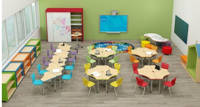
Figure 2. Class setting 1

Class setting is needed in the learning process so that the class is not monotonous and varied. Class setting also provides space for learners or students to bond with their peers. The recommended class setting in local wisdom-based literature learning can be observed in figure 1,2,3.