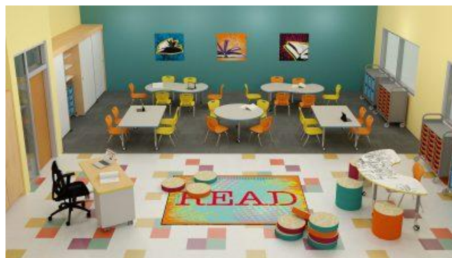
Figure 2. Class setting 3