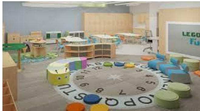
Figure 2. Class setting 2