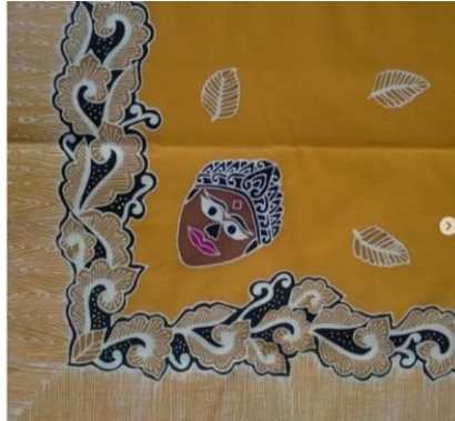
Figure 1: Mask Pattern of Batik Ron Tuwuh.

Karangploso attracts thought from carvings on Kidal Temple. moreover, Batik Ron Tuwuh is famend for developing a variety of batik designs primarily based on nearby inspirations in Pakisaji (radarmalang.jawapos.com) (Figures 1-3).