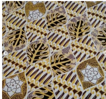
Figure 2: Monstera and Parang Bena of Batik Ron Tuwuh.