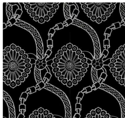
Figure 3: Sambung Manah of Batik Ron Tuwuh.

The aforementioned batik motifs' strong point serves as a promoting advantage for manufacturers who want to assist export Indonesian batik. The export trend of Indonesian batik is depicted in Figure 4.