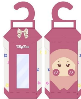
Figure 8. Visualization of Waykhu packaging design front view and back view

WayKhu product packaging, which measures 8.2 cm x 7.1 cm x 28 cm, uses 310 gsm art carton as the main material. Art carton was chosen because it has a smooth surface and is able to display sharp and bright color prints. The 310gsm thickness provides enough strength and rigidity to support the hijab product without being easily damaged, while still being lightweight to carry. On the front of the packaging, there is a transparent window made of mica plastic (clear PVC). For the final layer, the packaging is laminated with glossy laminate so that the surface feels smooth and shiny. The material of the ribbon decoration used is satin ribbon as a decorative accent that adds a feminine and premium impression.