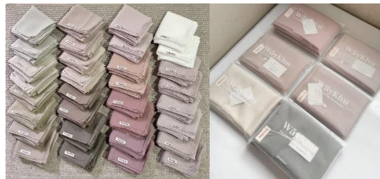
Figure 1. Waykhu products and Waykhu's old ziplock plastic packaging

WayKhu's hijab products use premium polycotton material that is soft, lightweight, and comfortable for everyday use. WayKhu's main target market is young women, so the product design and packaging are designed with a youthful and feminine. Sales are conducted offline as well as through marketplaces such as Shopee and TikTok Shop, to reach young consumers who are active on social media and accustomed to shopping online. Previously, Waykhu SME's rectangular hijab product packaging used simple packaging in the form of ziplock plastic. Meanwhile, according to Kusumaningrat (2018), in order for a product to stand out in the midst of competition, there needs to be a clear differentiator from other products, one of which is through packaging and design. Given that ziplock packaging is now widely used by various brands, additional innovation is needed in the visual appearance or packaging design elements so that Waykhu products remain attractive and competitive in the market.