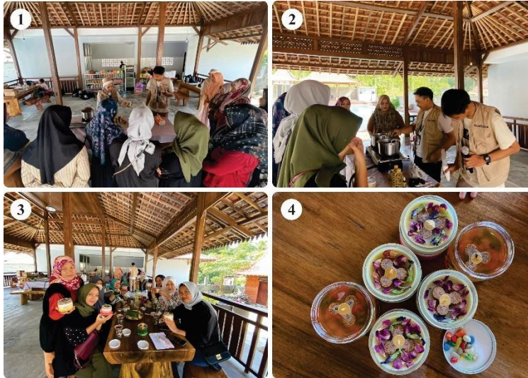
Figure 2. Product Development Process

The first stage, collecting tools and materials consists of: 1) Used cooking oil, 2) Essential Oil, 3) Night, 4) Stove, 5) Pot, 6) Stearin, 7) Glass Jar 350ml, 8) Candle Wick, 9) Float Axis, 10) Used Crayons, 11) Charcoal and soak used cooking oil with charcoal for 12 hours, to clean and remove the smell of used cooking oil.