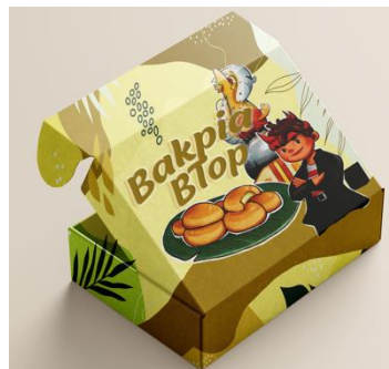
Figure 2. Visual Identity in Packaging design.

The results of the For the packaging design approach in this second alternative, visual elements are used, namely illustrations of the basic ingredients of Landmark Sidoarjo which are made asymmetrically, similar to the characteristics of Pia brebek which is circular in this alternative. These elements are composed to fill the packaging area to show a solid impression, as in the Bakpia Brebek Logotype [6]. In addition, the illustrations are composed not rigidly but irregularly, this is done to present a playful impression of the MSME brand.