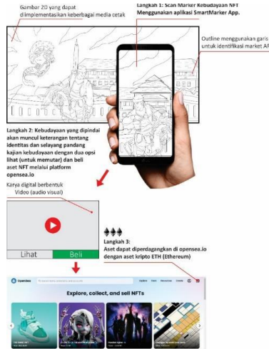
Figure 3. Development flow