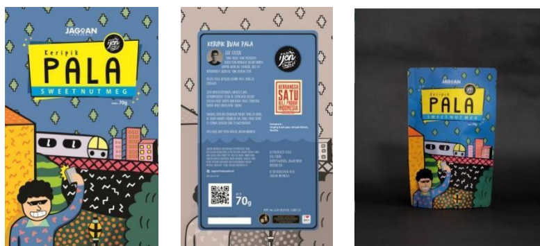
Figure 5. Packaging of Jagoan Indonesia Nutmeg Chip Products, adapted from Jagoan Indonesia

Jagoan Indonesia's swet nutmeg chips are packed in 70gr standing pouch. The pouch is made of aluminum foil and it used printed media as a design for outside layer of the package. It sized 22cm x 14cm and has 100 microns of thickness. The packaging is in the form of printed packaging,-so that the front side and the backside of the packaging are merged into one. The