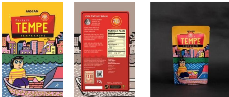
Figure 3. Packaging of Tempe Chips Jagoan Indonesia Products, adapted from Jagoan Indonesia