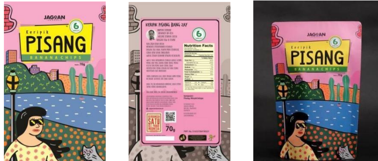
Figure 4. Packaging of Jagoan Indonesia Banana Chips Products, adapted from Jagoan Indonesia

Jagoan Indonesia's banana chips are packed in 70gr of standing pouch. This type of pouch is made from aluminum foil and equipped with a zipper lock feature. It sized 22cm x 14cm and has 100 microns of thickness. The packaging is in the form of printed packaging, so that the front side and the backside of the packaging are merged into one. This banana chip packaging uses pink color as the base, but it uses several colors for its illustration. In appearance, Jagoan Indonesia's Banana Chip Packaging is made with digital illustration techniques, and there is whitespace on this package. The color used on the front of the packaging is a combination of full and soft color, while on the back side of the packaging uses monochrome color and dominated by pink color. In addition, there is also the story of the manufacturer/product message that lies behind Jagoan Indonesia in designing the packaging of this product and making evidence that the Jagoan Indonesia is based on 'sociopreneur'. Typographic fonts used are also not many, only 3-4 kinds of font style with 1 group of fonts, namely Sans Serif. The layout has a harmonious composition. The balance, emphasis, unity and the proportion of the product are good.