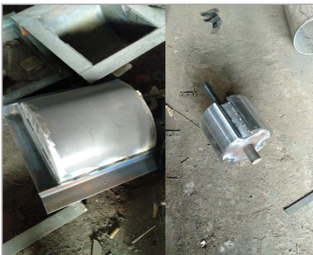
Figure 4. Gearbox Efficiency and Agarwood Blades

The development of the agarwood chopper machine uses the concept of a simple blade with a double gear box for gaharu wood chopper, this mechanism of course facilitates the wood chopper process so that the output is smoother, with a large motor and a slimmer blade will produce chopped wood according to the needs of agarwood farmers in implementing akyu agarwood product. Here in Figure 4 is shown the gearbox and blade cutting agarwood.