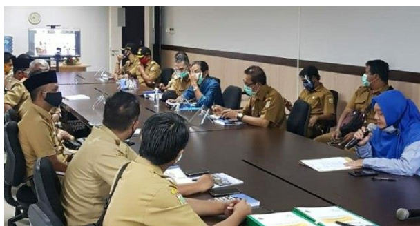
Figure 1. Meeting to determine the superior potential of partner villages

The concept of Strengthening Partner Villages (PDM) through Cooperation in strengthening regional potential. Through the cooperation of potential village governments and universities, in this case the State University of Malang is one of the main targets to advance areas that have the potential to be developed into productive areas. Dr. Markus Diantoro, said that the partner village collaboration was carried out to encourage each village to make superior thematic products according to the Government's instructions, namely One Product, One Village (Online, accessed February 16, 2022, http://lp2m.um.ac.id/ ) In Figure 1.