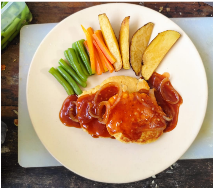
Figure 5. Tofu Steak Product Served on a Plate

During the process of making tofu steak, suggestions were also given to ensure that the resulting tofu steak was of good quality (Carrenõ & Dolle, 2018). In addition, discussions and question-and-answer sessions were held on other aspects of entrepreneurship, and participants were motivated to develop an entrepreneurial spirit and interest in becoming self-reliant.