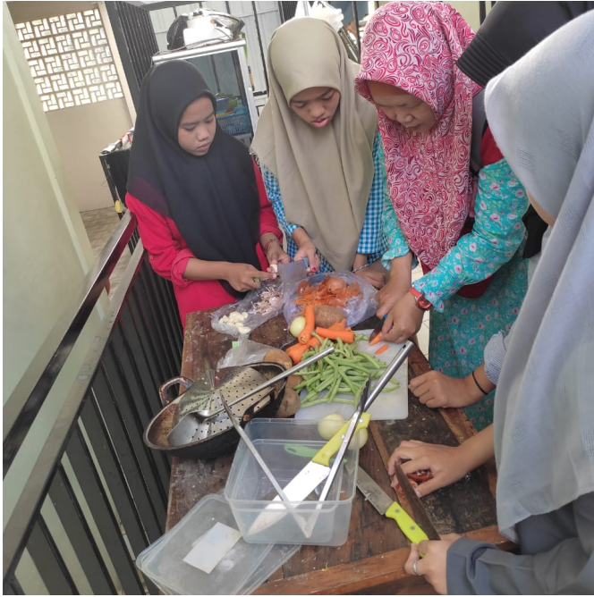
Figure 4. Cutting Process for Additional Ingredients and Sauce