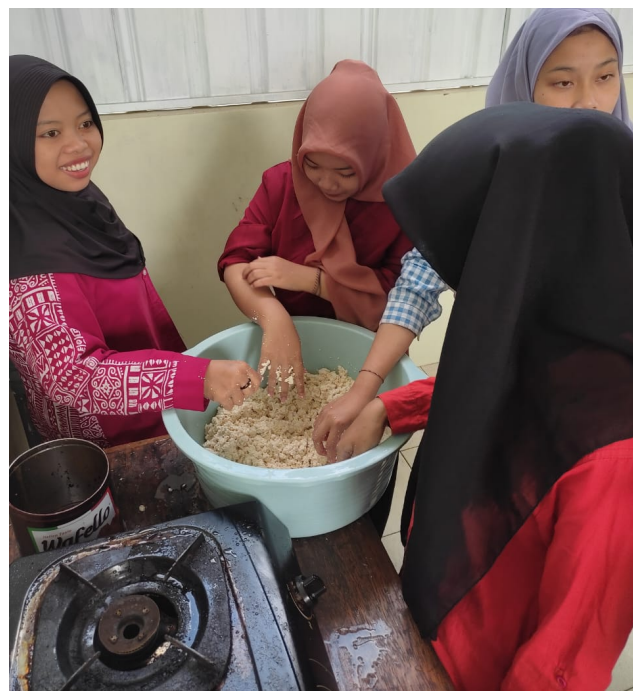
Figure 2. Process of Making Tofu Steak Dough

The process of making tofu steak begins by steaming white tofu and then cooling it. After that, boil the mushrooms, then blend the boiled mushrooms until they have a fairly smooth texture. Continue by mixing the tofu steak ingredients in a container and stir until evenly mixed (see Figure 2).