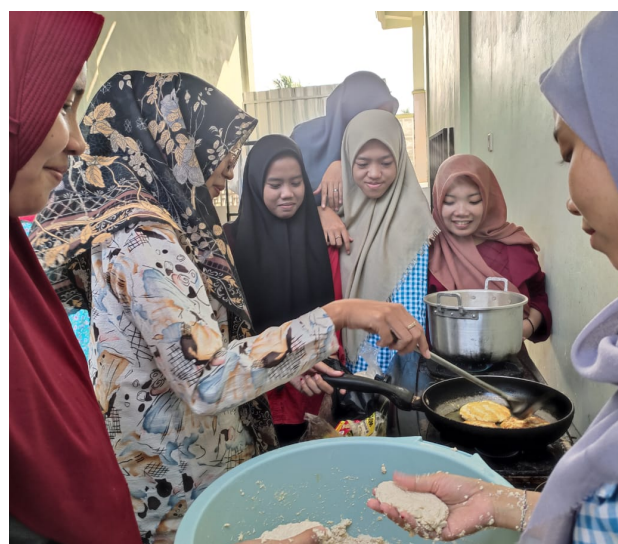
Figure 3. Process of Forming and Frying Steak Dough

Once the dough is ready, shape it and fry it in a Teflon pan until golden brown (as shown in Figure 3).