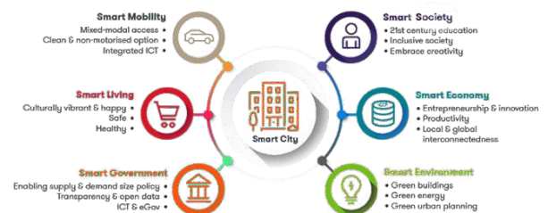
Figure 1. Key Components of Smart City

A high-tech urban area that combines people, data and technology to improve the quality of life and welfare of the community is known as a smart city. According to (Iloke & Okoro, 2018), smart city consists of smart governance, smart economy, smart mobility, smart environment, smart living, and smart people. In addition, Internet of Things, Internet of Data, People, and Internet of Services are the technology and infrastructure components supporting smart cities. Figure 1 shows the overall elements of a smart city.